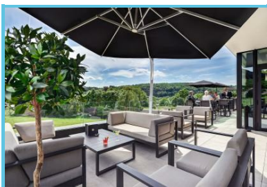
R hotel experiences

Square Philippe Gilbert 1 Remouchamps - 4920