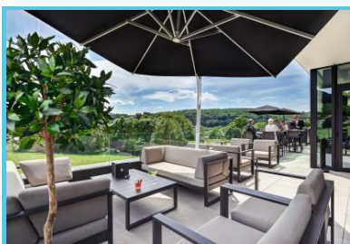
R hotel experiences

Square Philippe Gilbert 1 Remouchamps - 4920