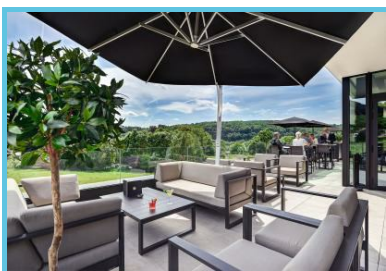
R hotel experiences

Square Philippe Gilbert 1 Remouchamps - 4920