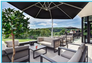
R hotel experiences

Square Philippe Gilbert 1 Remouchamps - 4920