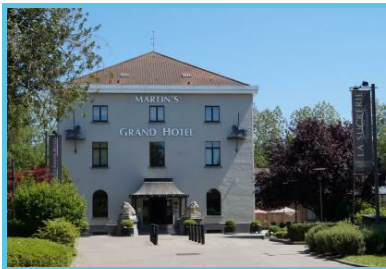
Martin's Grand Hotel

Chaussée De Tervuren 198 Waterloo - 1410